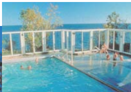
Outdoor Pool and Spa Heated and Open all year