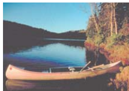
Lake Superior and inland lake canoeing adventures