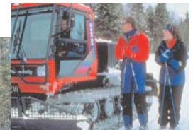
Snowshoeing and Cross Country Skiing are two very popular winter activities

Current detailed activity schedules are available by request or online at www.bluefinbay.com