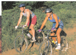
Explore the Superior National Forest on almost endless trails